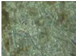
Microbe population 48 hours after application of Organic Gem™ *

There is no petrochemical fertilizer that can do this!