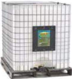
1,040 liter tote