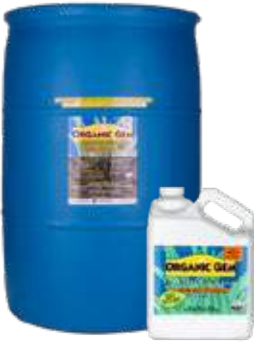
100 liter drum and 4 liter gallon